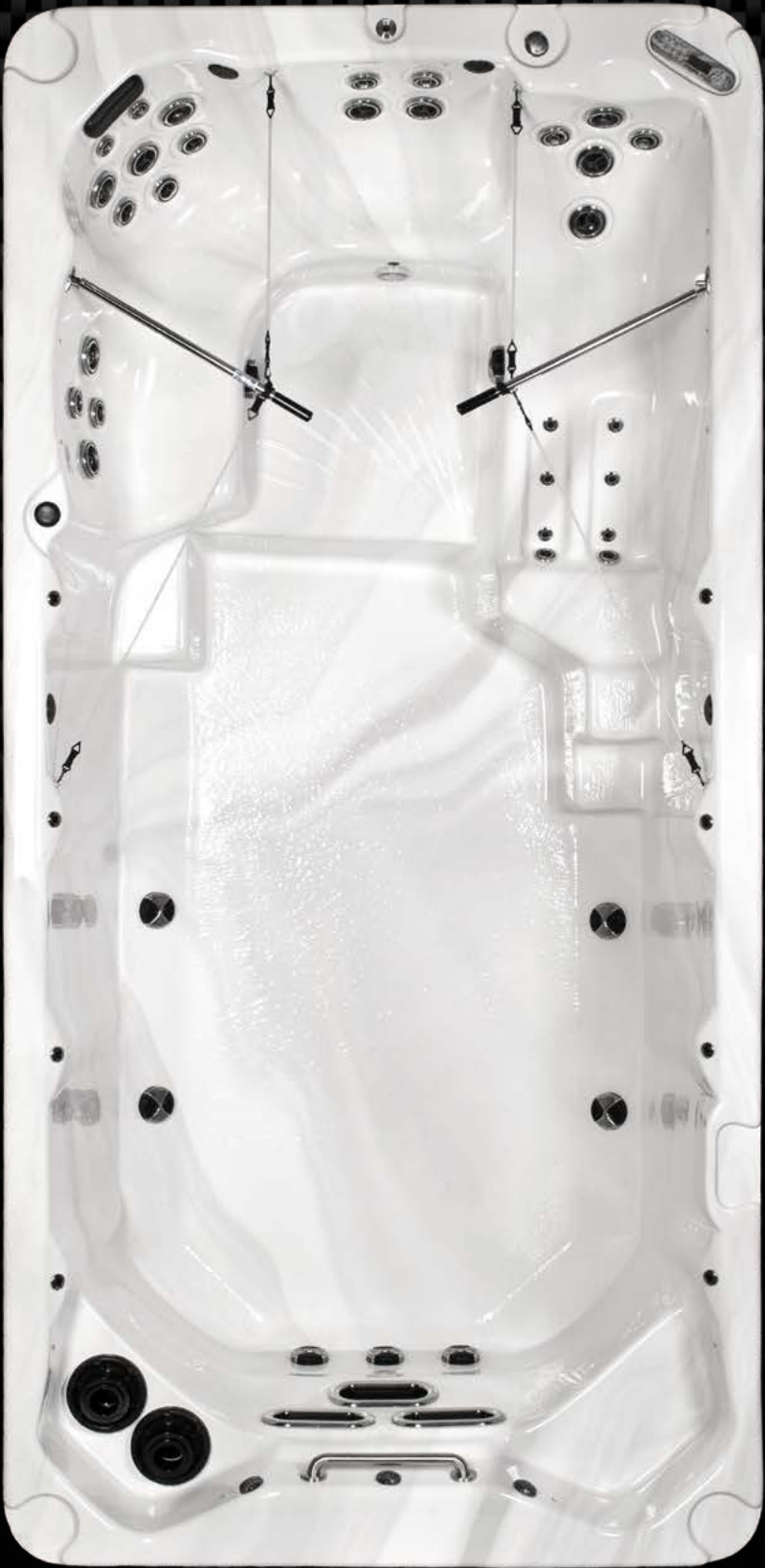
Specs shown are a summary of features and options for each spa model. For more details please see a sales associate.