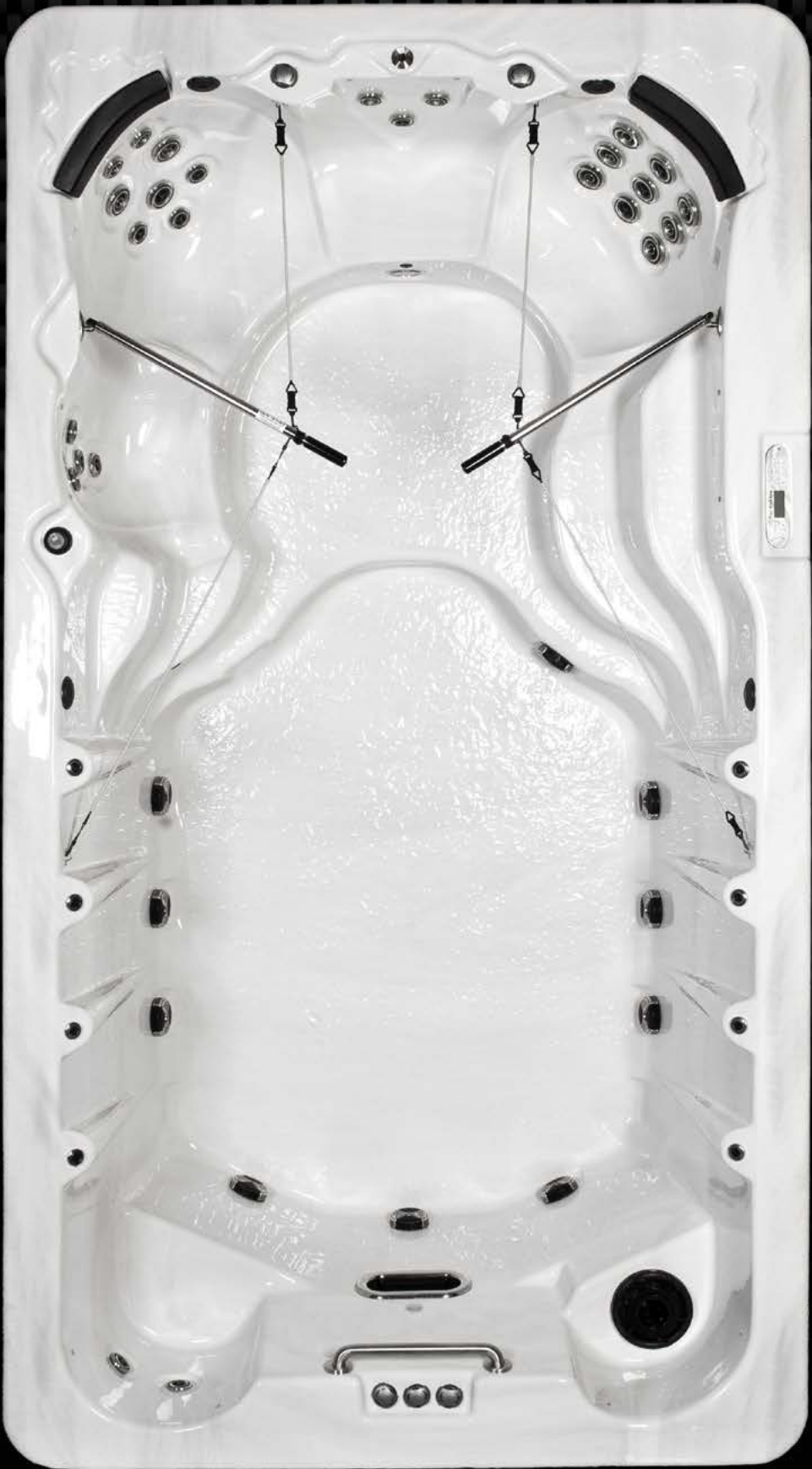
Specs shown are a summary of features and options for each spa model. For more details please see a sales associate.